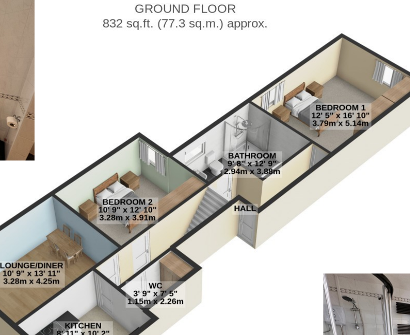
TOTAL FLOOR AREA: 832 sq.ft. (77.3 sq.m.) approx.