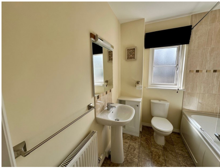
1ST FLOOR 331 sq.ft. (30.8 sq.m.) approx.