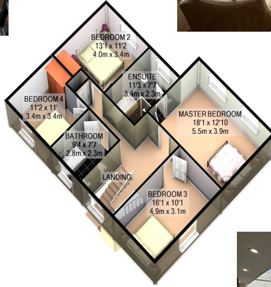
1ST FLOOR APPROX. FLOOR AREA 973 SQ.FT. (90.4 SQ.M.)