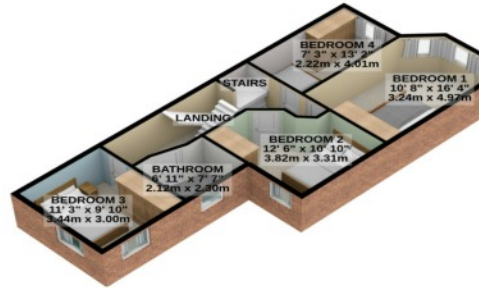
ATTIC ROOM 212 sq.ft. (19.7 sq.m.) approx.