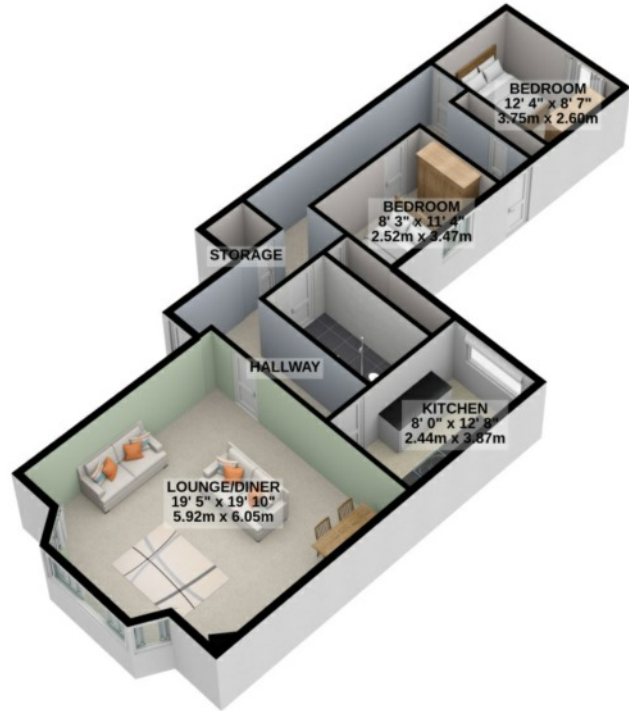
TOTAL FLOOR AREA : 992 sq.ft. (92.2 sq.m.) approx.

For illustrative purposes only. Decorative finishes, fixtures, fittings and furnishings do not represent the current state of the property. Measurements are approximate. Not to scale.