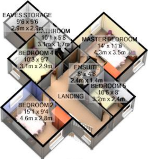
1ST FLOOR APPROX. FLOOR AREA 837 SQ.FT. (77.7 SQ.M.)