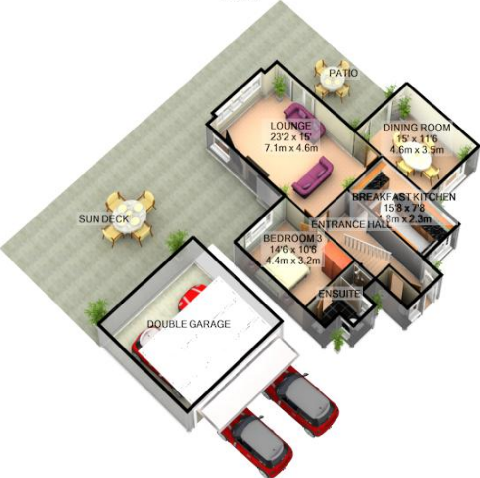
GROUND FLOOR APPROX. FLOOR AREA 1344 SQ.FT. (124.8 SQ.M.)

TOTAL APPROX. FLOOR AREA 2181 SQ.FT. (202.6 SQ.M.) Made with Metropix ©2011