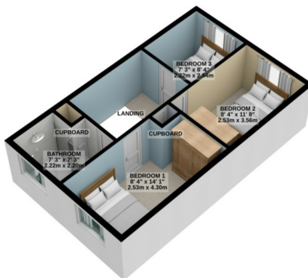
TOTAL FLOOR AREA : 804 sq.ft. (74.7 sq.m.) approx.

For illustrative purposes only. Decorative finishes, fixtures, fittings and furnishings do not represent the current state of the property. Measurements are approximate. Not to scale. Made with Metropix © 2023