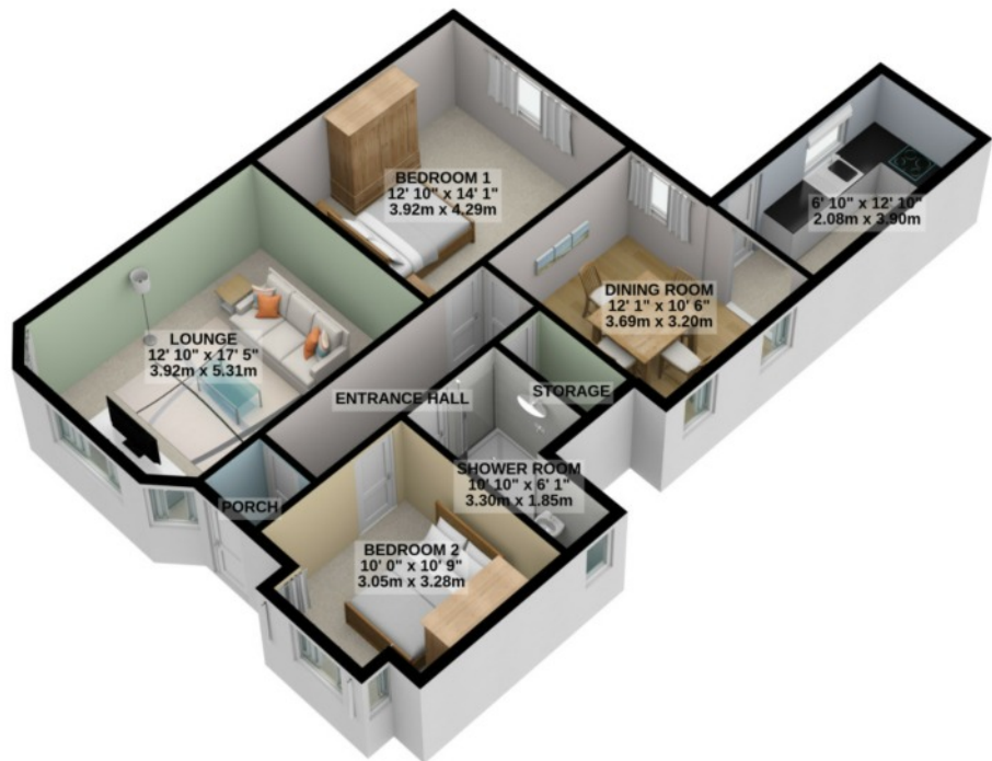
TOTAL FLOOR AREA : 852 sq.ft. (79.2 sq.m.) approx.

For illustrative purposes only. Decorative finishes, fixtures, fittings and furnishings do not represent the current state of the property. Measurements are approximate. Not to scale. Made with Metropix © 2023