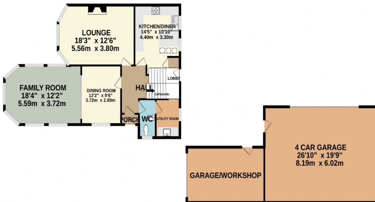
1ST FLOOR 648 sq.ft. (60.2 sq.m.) approx.