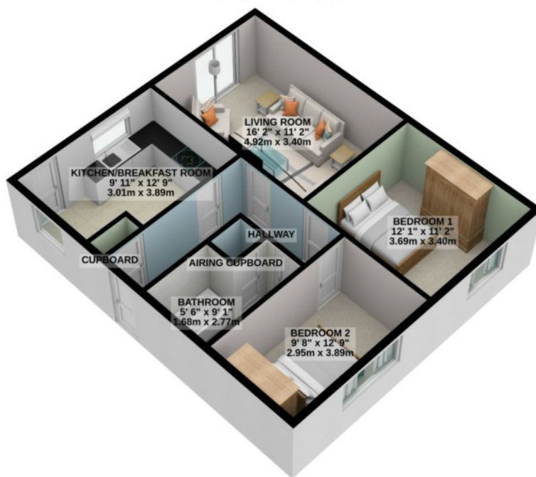
TOTAL FLOOR AREA : 690 sq.ft. (64.1 sq.m.) approx.

For illustrative purposes only. Decorative finishes, fixtures, fittings and furnishings do not represent the current state of the property. Measurements are approximate. Not to scale. Made with Metropix © 2023