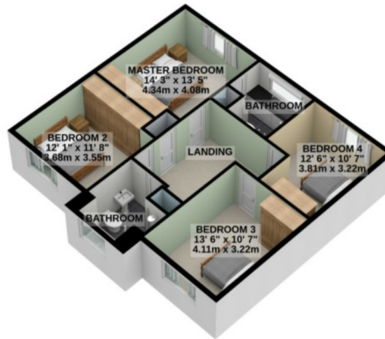
TOTAL FLOOR AREA : 2045 sq.ft. (190.0 sq.m.) approx.

For illustrative purposes only. Decorative finishes, fixtures, fittings and furnishings do not represent the current state of the property. Measurements are approximate. Not to scale. Made with Metropix © 2022