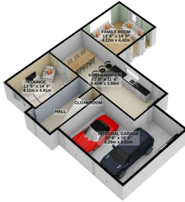
1ST FLOOR 801 sq.ft. (74.4 sq.m.) approx.