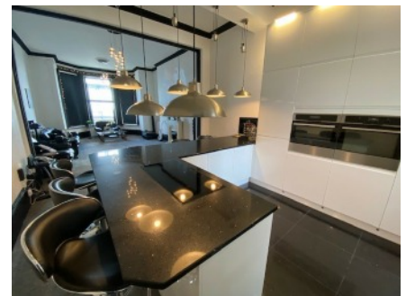
TOTAL FLOOR AREA : 1281 sq.ft. (119.0 sq.m.) approx.

Whilst all particulars are believed to be correct, neither Property Wise Limited, or their clients guarantee their accuracy nor are they intended to form part of any contract. Floorplans are for illustrative purposes only, decorative finishes, fixtures, fittings and furnishings do not represent the current state of the property. Measurements are approximate and not to scale.