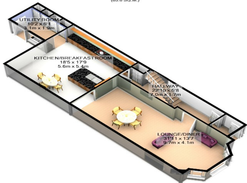
GROUND FLOOR APPROX. FLOOR AREA 960 SQ.FT. (89.2 SQ.M.)

TOTAL APPROX. FLOOR AREA 2204 SQ.FT. (204.8 SQ.M.)