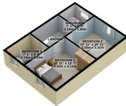
TOTAL FLOOR AREA : 1081 sq.ft. (100.4 sq.m.) approx.

For illustrative purposes only. Decorative finishes, fixtures, fittings and furnishings do not represent the current state of the property. Measurements are approximate. Not to scale. Made with Metropix © 2021