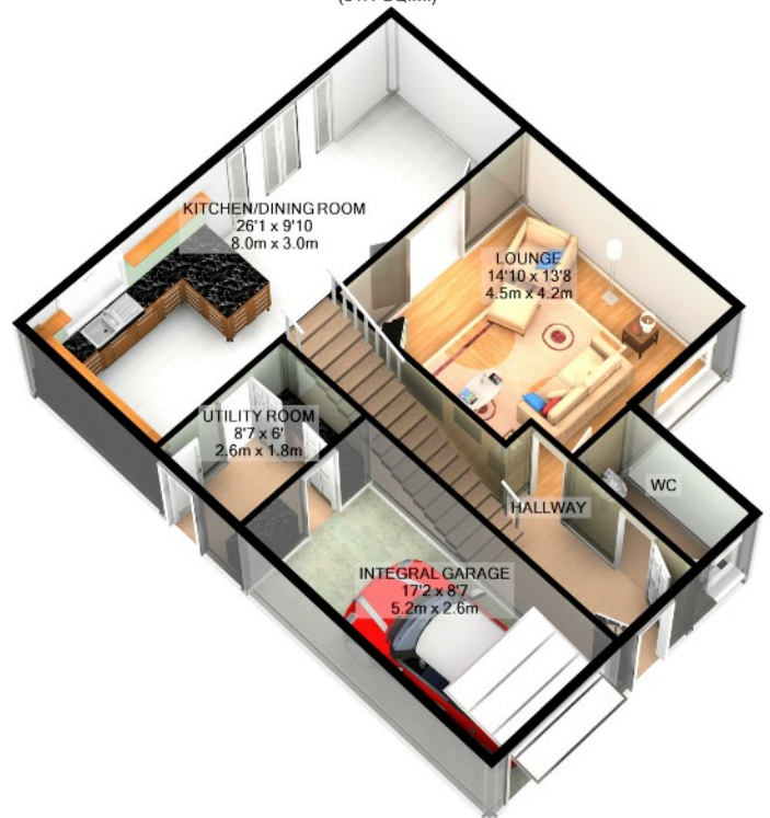
GROUND FLOOR APPROX. FLOOR AREA 790 SQ.FT. (73.4 SQ.M.)

TOTAL APPROX. FLOOR AREA 1447 SQ.FT. (134.4 SQ.M.)