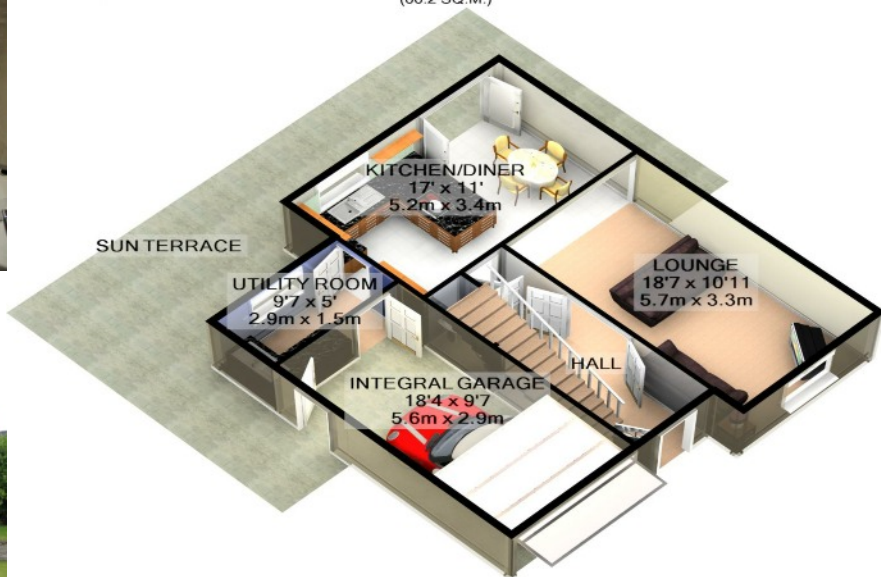
GROUND FLOOR APPROX. FLOOR AREA 712 SQ.FT. (66.2 SQ.M.)

TOTAL APPROX. FLOOR AREA 1857 SQ.FT. (172.5 SQ.M.)